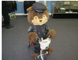
Officer Bear often patrols in front of the Center. Make sure you obey the speed limit!