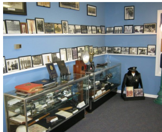
Part of the museum collection