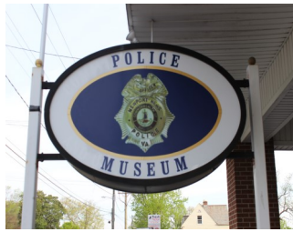
The sign that graces our location