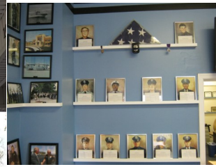
A tribute to the Newport News Police Department's Fallen Officers