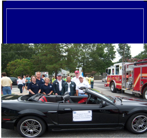
Denbigh Day Parade