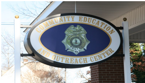
Volunteer at the Community Education