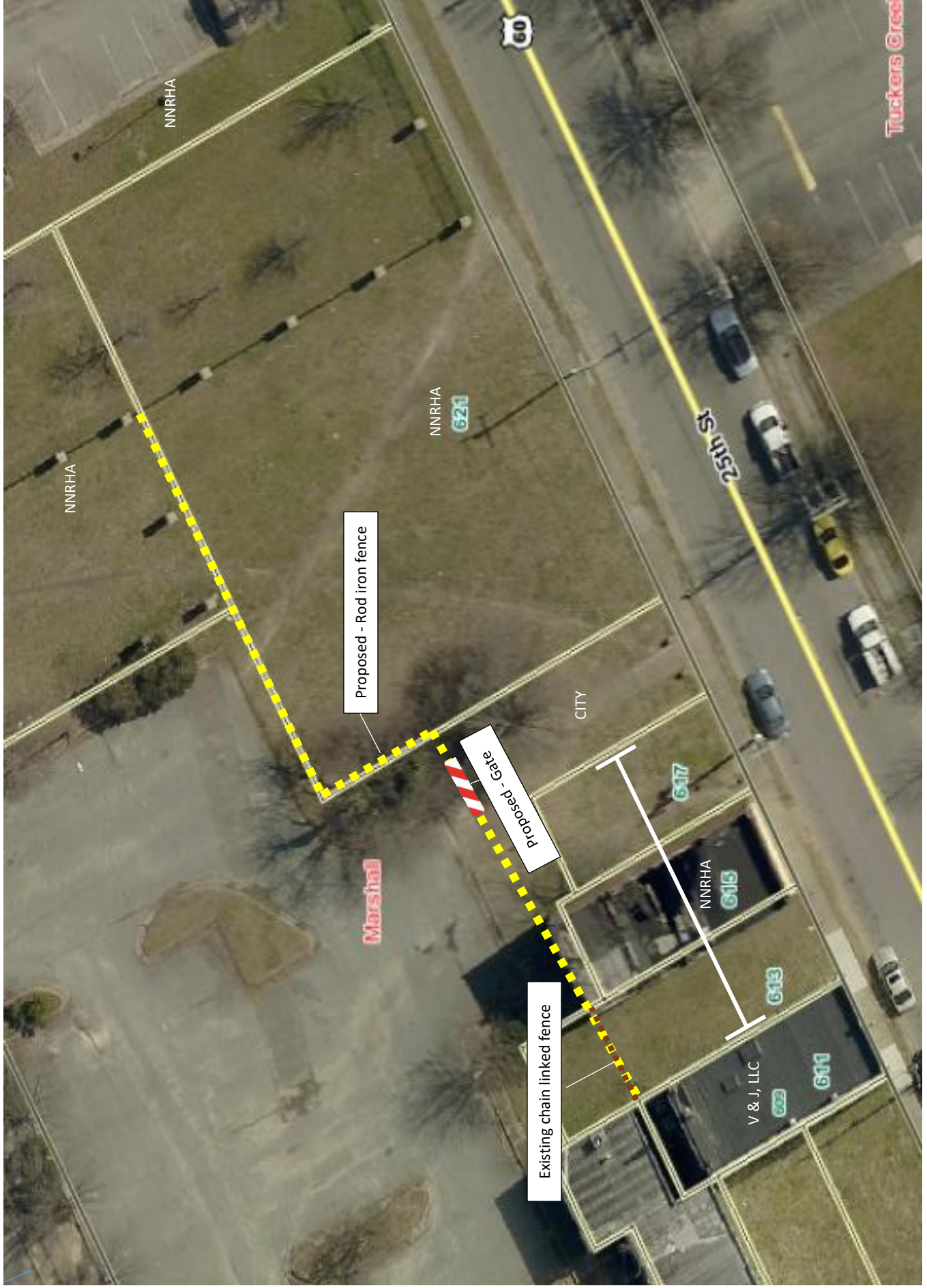
Aerial exhibit: MLK, Jr. Plaza Park with 6-foot Iron Rod Fence (25th Street)